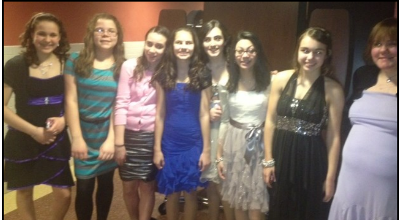
Seventh grade girls take time off from dancing with their friends to pose at the Valentine's Dance.