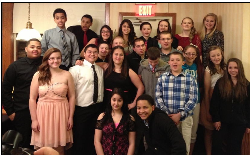
(Above): Seventh and eighth grade HMS students pose to make a memory after the Valentine's Dance on Friday, February 22, 2013.