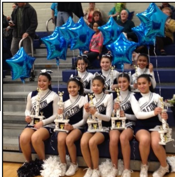
(Below): 8th grade cheerleaders pose with their trophies at their farewell home game of the season in February.